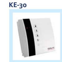
KE-30 – Battery Operated 2-Way Wireless Keypad

HomeLogiX™'s wireless communication supports a built-in keypad, internal and external sound system, and a two-line backlit LCD, that in addition to 40 zones (39 wireless and one hardwired), four remote keypads, four wireless repeaters, four wireless sirens, and eight remote controls, as well as 2-way RF products complete the solution for maximum peripheral security.