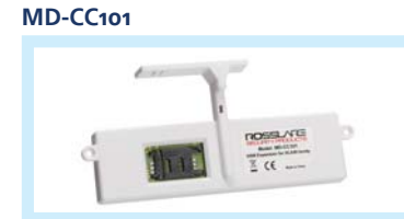
MD-CC101 – GSM Stick – GSM Communicator module for HomeLogiX panels

Furthermore, HomeLogiX™'s wireless communication option ensures that if the phone line is cut, the system is not compromised eliminating a would-be intruder's ability to disable communication by cutting the home's phone or cable lines. Anti-masking capabilities of our PIR sensors and advanced Tamper prevention complete the solution against compromising of the system.