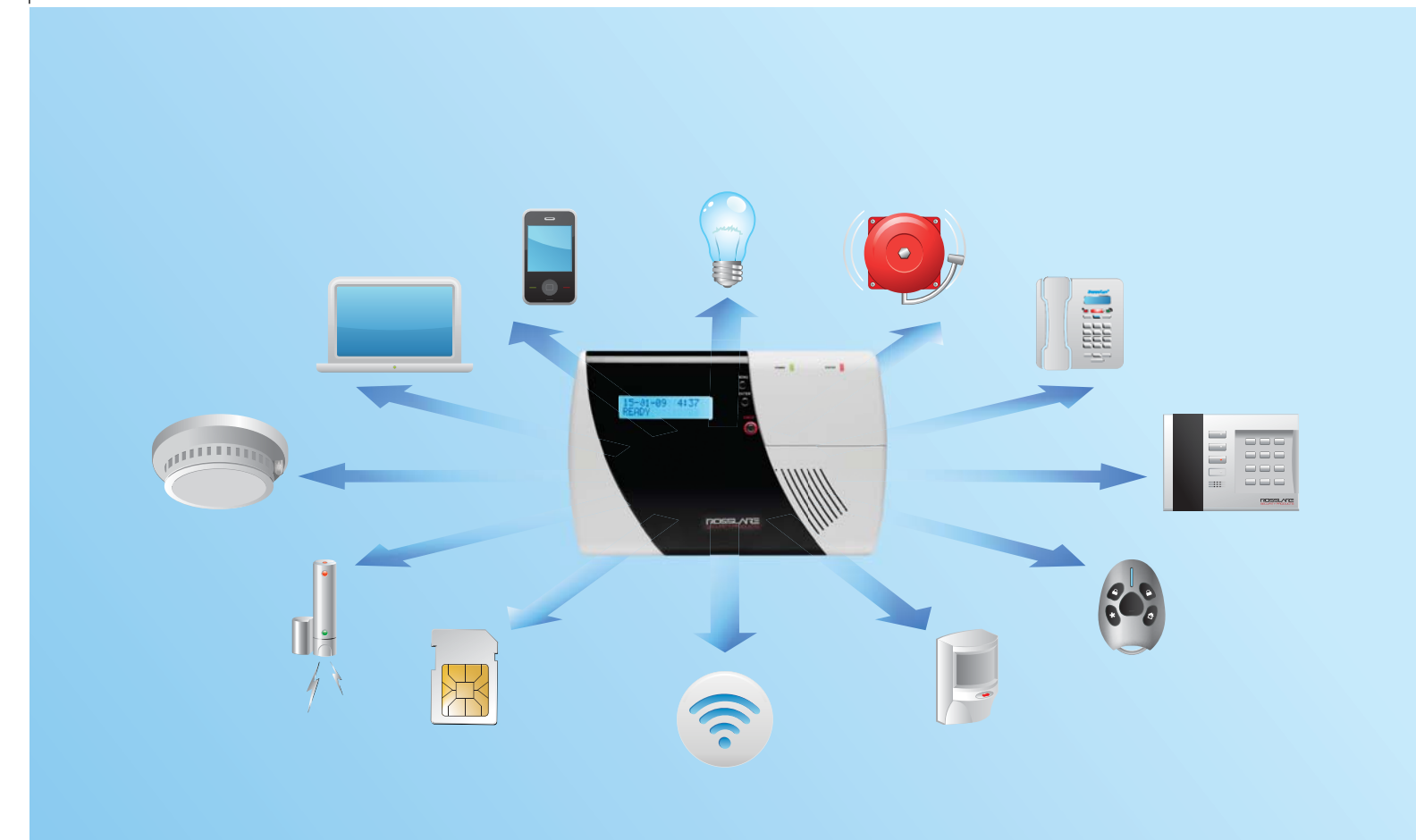
Complete HomeLogiX solutions

Offering the latest in security technology, the HomeLogiX™ family of advanced burglar and fire alarm wireless solution, have all the benefits of advanced wireless technology, enclosed in a compact, aesthetic, easy-to-use control panel. All compatible accessories such as keypads, detectors, sensors and other peripherals are conveniently installed around your home or office, with the flexibility to add, remove, or change their location as desired.