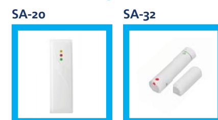
Wireless Vibration Detector